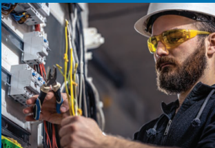
CAREER TECH - PAGES 7-10