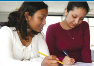
ESL - PAGE 6

The information printed herein regarding fees, class times and location is up to date at the time of printing. Please direct any questions about the courses or programs to the Main Campus/Pioneer Center located at 160 N. Barranca Avenue, Covina, CA 91723, or call (626) 974-4200. For more information, please visit our website at: www.tri-communityadulted.org