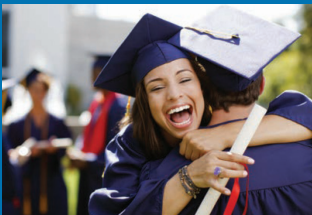
HS DIPLOMA - PAGE 6